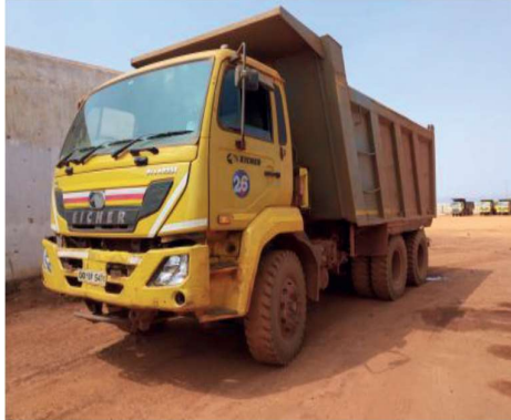
TIPPERS -04 Nos