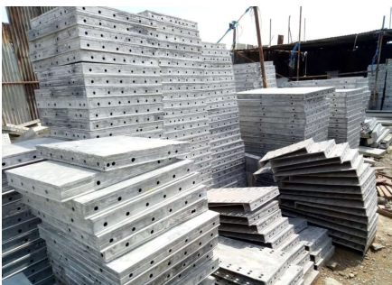
Mivan shuttering material-7200 Sqm