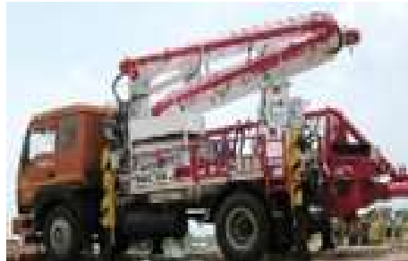
Boom Placer-1 No