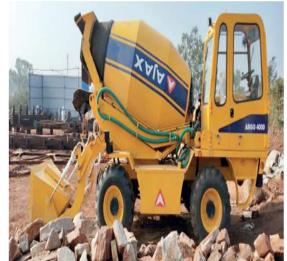
SELF LOADING CONCRETE MIXERS – 2 NOS