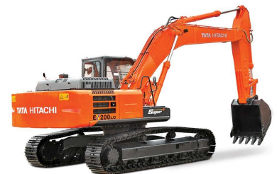
Ex-200 Excavator-1 No

It is not the beauty of the building you should look at: it's the construction of the foundation that will stand the test of time.