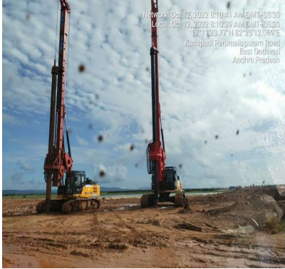
Rotary Drilling Piling Rig-4 Nos