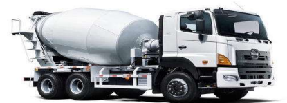
transit mixers-4 Nos