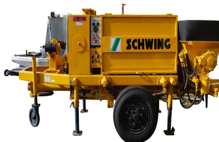
Concrete Pump-1 No