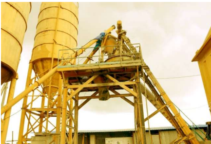
60 cum/Hr Capacity Batching plant-1 No